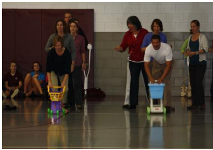
Pep Rally – Staff Relay Race