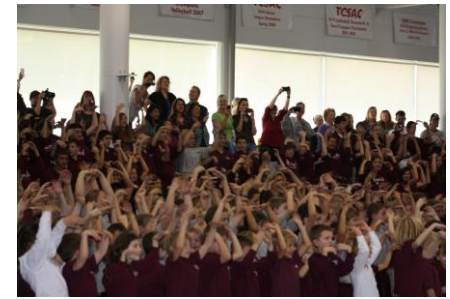
Pep Rally – Students' Viral Dance