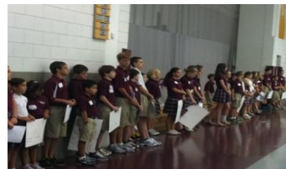
35 student volunteers helped show our new students around the school